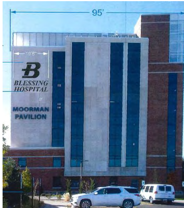
Proposed Illuminated Signs at 1005 Broadway