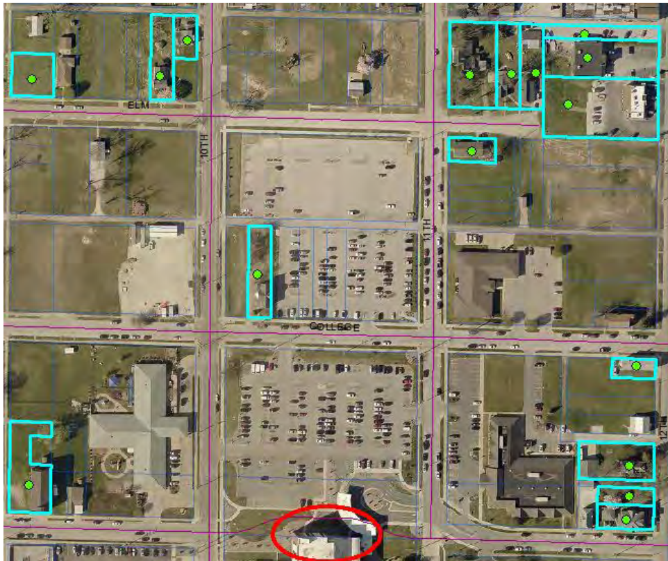
Property ownership north of the proposed sign