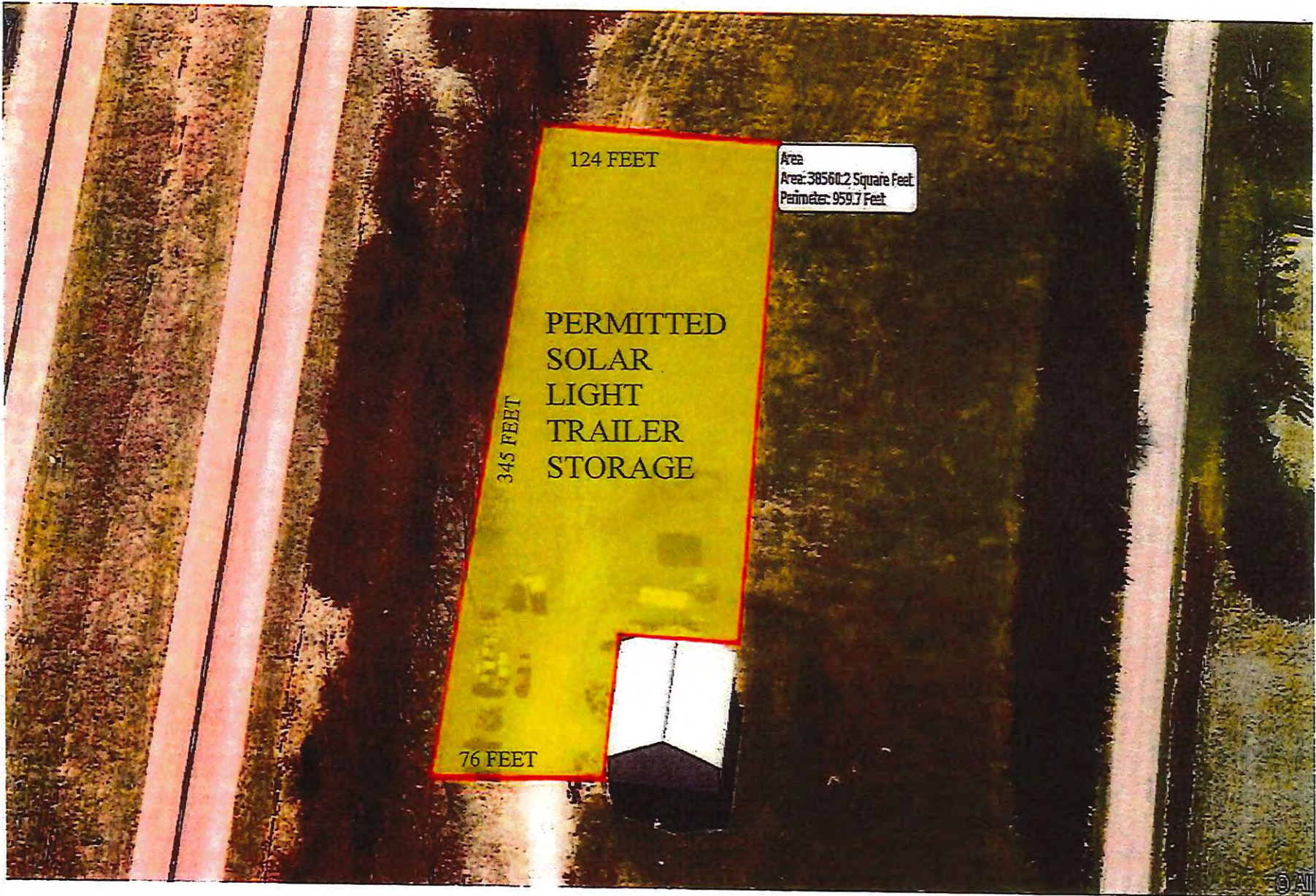
EXHIBIT A PROPOSED EXTERIOR STORAGE AREA FOR SOLAR LIGHT TOWER TRAILERS