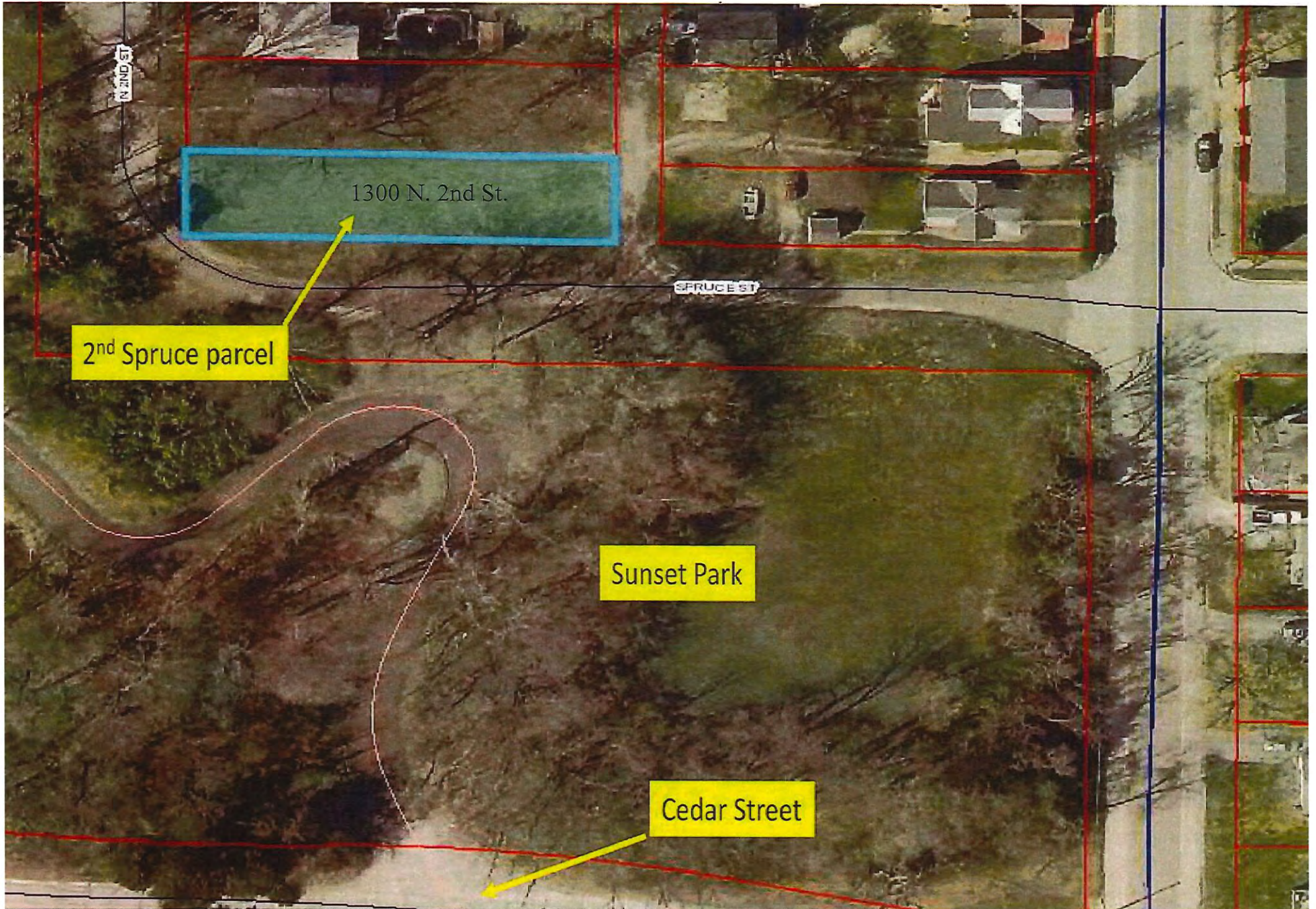
Exhibit A 1300 N. 2nd Street Park District Land Donation